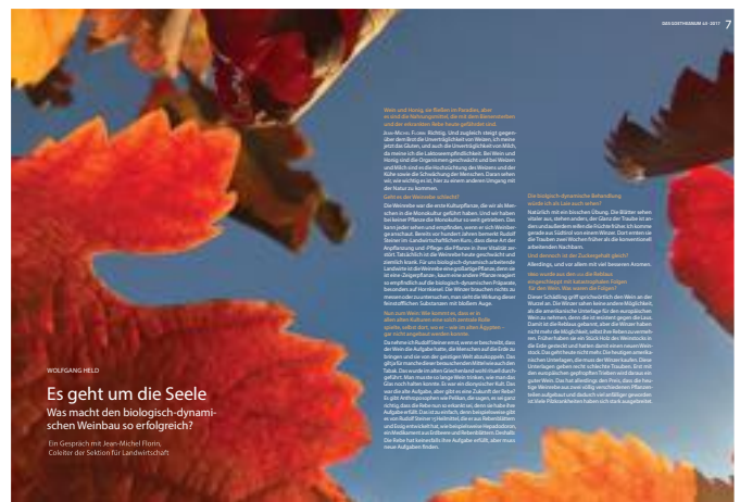
A double page about wine in Das Goetheanum 43/2017