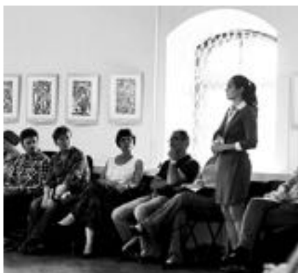
The Soul of Europe: concluding plenary discussion

A few aphoristic statements are worth mentioning that were made by hosts and guests, because they capture the liveliness and openness that permeated this conference. «How can we become better