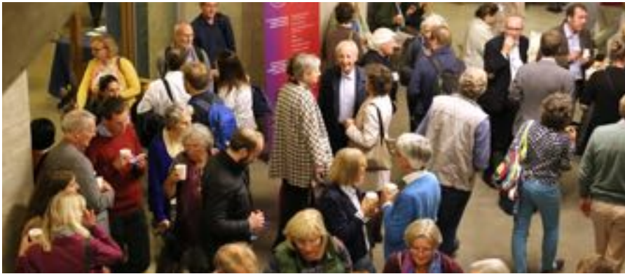
The quality of therapeutic community building: the moment of meeting

Medical Section: Annual Conference - «Living Warmth»