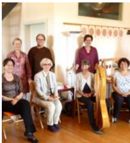
Planets and the soul life: a meeting of music therapists

duced to that prevalent on Saturn – i.e. minus 147 degrees Celsius – astonished us all.