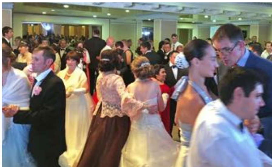
Gorgeous gowns, suits and folk costumes: gala event during the World Congress

Yekaterinburg (ru): First World Congress for people with disabilities