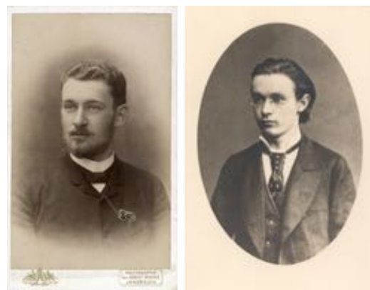
Steiner's friend Rudolf Ronsperger (29 Aug. 1863 – 2 Oct. 1890) Rudolf Steiner as a student, 1882

Having collated all the available documents from Rudolf Steiner's school and