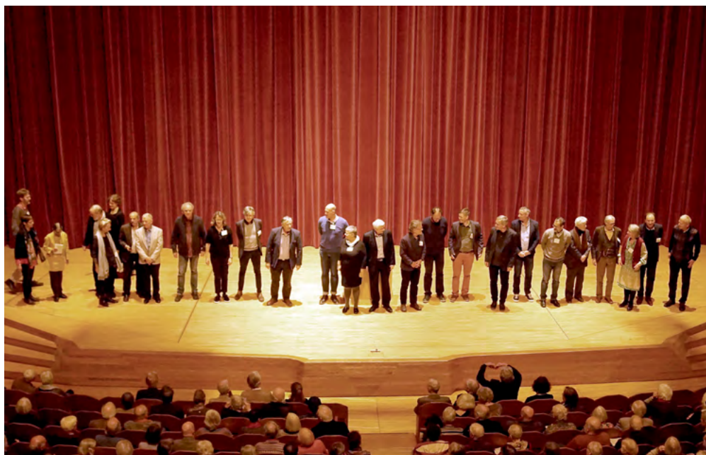
2019 Annual General Meeting