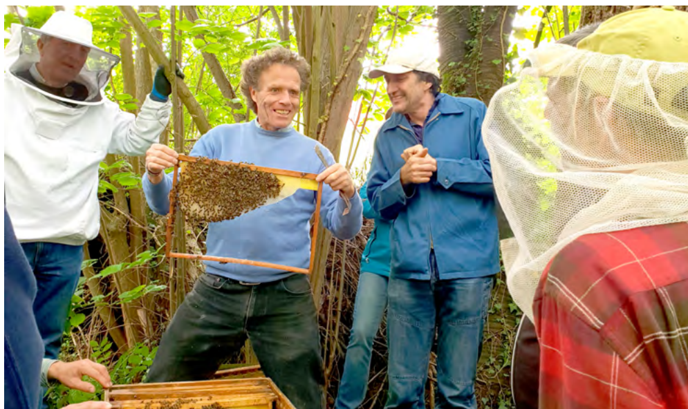
Beekeeping at the Goetheanum