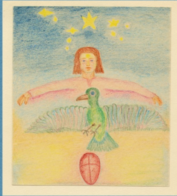
Drawing by Karl König for week 32 of Rudolf Steiner's Calendar of the Soul